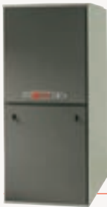
XV95 Furnace With Variable-Speed Motor and Comfort-R™

* An XL900 Trane Comfort Control is required for all XC95 communicating furnaces. A telephone access module is also required for remote access.